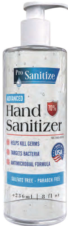
# PHS0018011P (with pump)