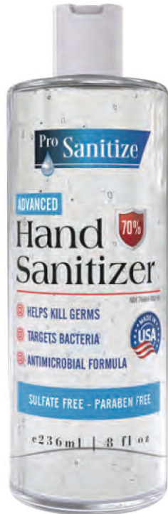
# PHS0018011C (with cap)